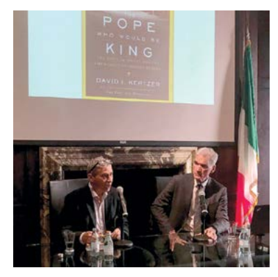
#davidkertzer #inconversation #ici May 2, 2018