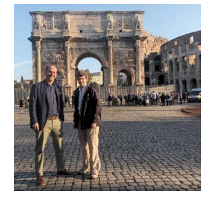
#lynnlancaster #mellonprofessor October 13, 2018