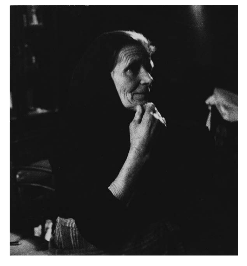
Esther Bubley, Matera, Italy , 1953 (printed 2017), gelatin silver print, 40 \times 30 cm. Esther Bubley Archive, Standard Oil (New Jersey) Collection, SONJ 78227 m27a, Archives and Special Collections, University of Louisville.

Conversation/Conversazioni: Imagining Matera 12 December Italian Cultural Institute 686 Park Avenue New York, NY