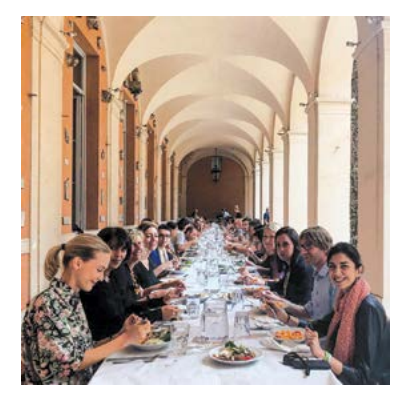
#fellows #week1 September 13, 2018