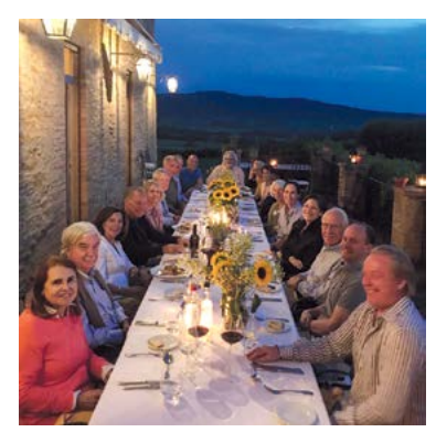
#trustees #tuscany June 3, 2018