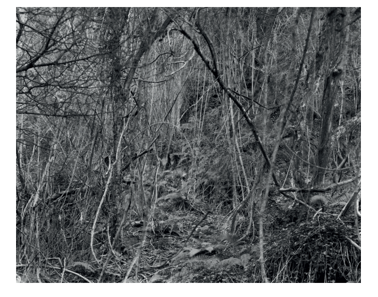
The Structure of a Forest #12, 2021 Archival pigment print 155x192 cm (artwork © Fabio Barile)

Building on a long tradition of artists working with botanicals, Camoni rehabilitates these weeds and gives them new value. In her case, the shapes of the plants are preserved, maintaining their integrity even as they become the artwork. We are witness to a process unfolding, as floral traces transmute into a parade of talismanic figures. Camoni's silks remind us of the continual, unending metamorphosis of things, and of the impossibility of ever pinning them down. (ER)