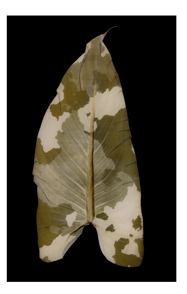
Military Foliage #7, 2010 Chlorophyll print and resin 40x24 cm (artwork © Binh Danh)