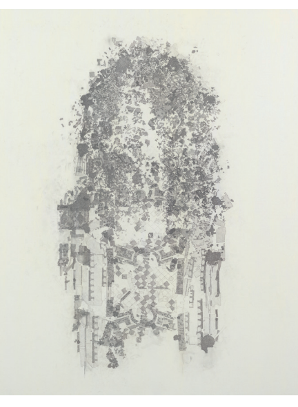
Encyclopédie III , 2010 Acrylic and graphite on canvas 196xI51 cm (artwork © Guillermo Kuitca; photograph courtesy of the artist and Hauser & Wirth. Photo credit: Alex Delfanne)

(artwork © William Dougherty; photograph courtesy of the artist)