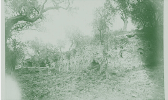
Aqueducts - Tivoli, Aqua Marcia, a Castellum or Reservoir rebuilt by Trajan, on the Via di Carciano. 1867-1870